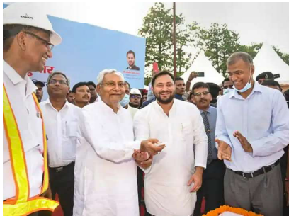
Agency Patna, August 24: