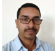
By: M.R. Lalu

Should the world have voiced its sentiments louder against the stabs that Salman Rushdie had on his neck and face? The versatile author with critical wounds cautions the world about the extent into which religious fanaticism has stretched its ugly claws. Should there be a sensible effort to quell the madness that distorted spiritual theories pounce on the world with? Can there be a solution at all in this regard? I suspect the laxity with which the world deals such ruthlessness. Universal epithets to narrate freedom of speech and expression could be seen fading into insignificance. The effect of such live narratives is not probably meant for religions with exclusive mindset. The slow death of Salman Rushdie would accentuate the power centers that enjoy decreeing fatwas and essentially their belligerence would grow manifold and unquestioned. The New York stabbing on one of the most celebrated writers would leave an ugly question destined to remain unanswered forever. Why do clerics go scot-free after every fatwa and the execution that follows? A life in exile since 1989, Salman Rushdie must have known the real threat that awaited him. The Ayatollah fatwa took 33 years to spill blood, slitting the old man's wrinkled skin. Though he kept ascending to fame after every book that he wrote, the inner core of the writer must have sensed the dead man in him. Rushdie's wounds would make people sense the